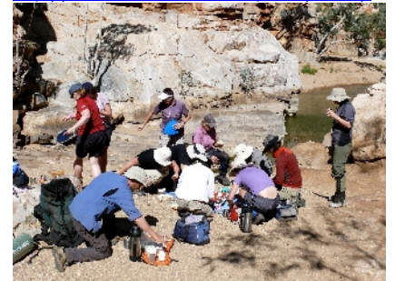
Larapinta girls relax by a Billabong!