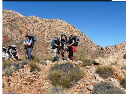
Larapinta Team in the stunning wilderness 09