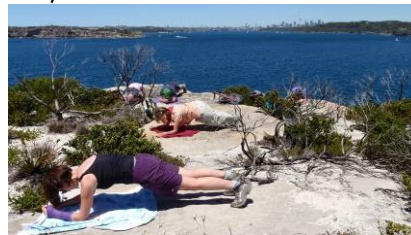
Friday Manly girls plank at Old Mans Hat

Bonus Bootie Camp Sat 19 th for charity 6am, Balmoral Oval.